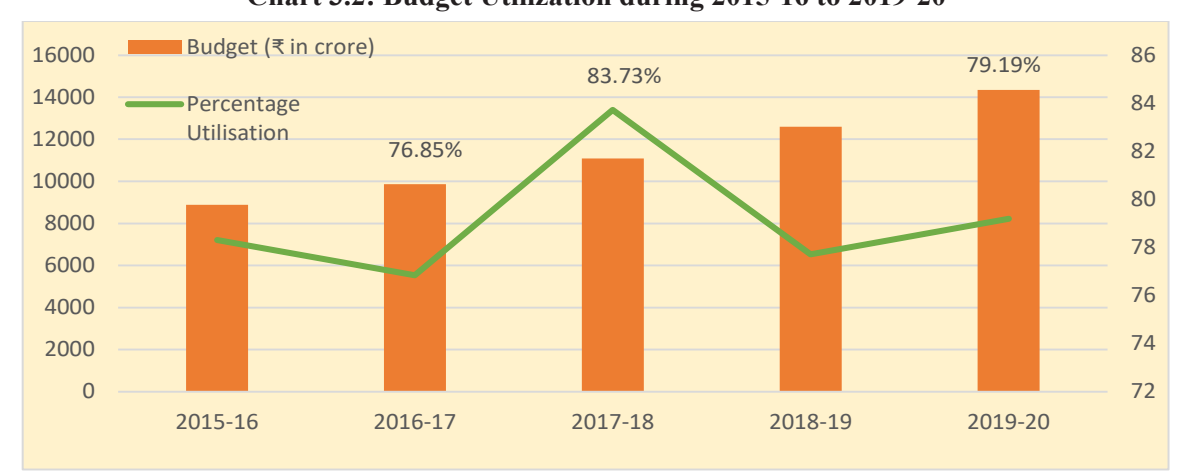
Chart 3.2: Budget Utilization during 2015-16 to 2019-20

Utilisation of budgeted funds by the State has been sub-optimal every year during the past few years. The extent of savings during the last five years is given in Chart 3.2 .